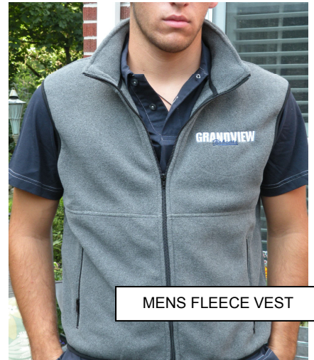
MENS FLEECE VEST