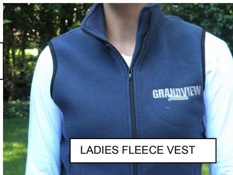
LADIES FLEECE VEST