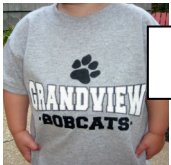
KIDS SHORT SLEEVE T