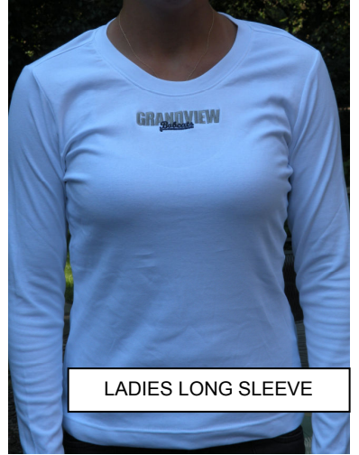
LADIES LONG SLEEVE