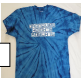
KIDS TIE DYE